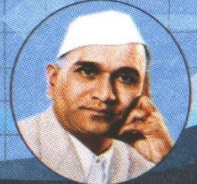
Karmaveer Bhausaheb Hiray